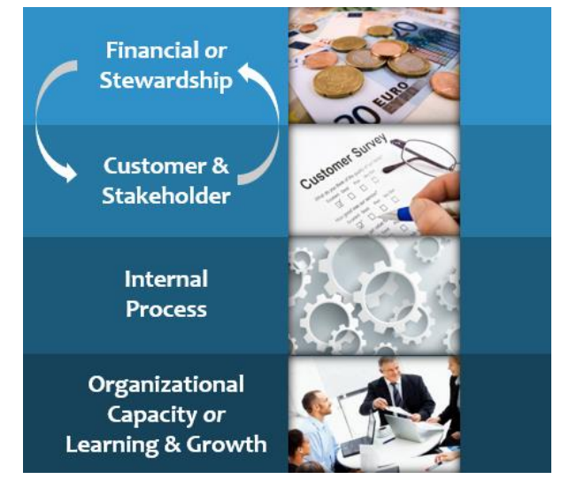
Figure 1: The Four Balanced Scorecard Perspectives

foundation of the other perspectives – the physical infrastructure, culture, tools and technology, knowledge and skills, and information systems required to create, plan, design, and deliver products and services to customers and stakeholders. Organizational capacity is a mix of tangible (people, tools, systems, structures) and intangible assets (ideas, culture) that allow the " inspiration " to bloom.