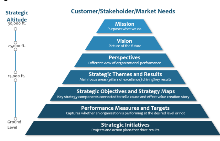
Figure 2: Strategic Planning and Thinking Using the Balanced Scorecard

Figure 2 shows the logic of how a strategy-based balanced scorecard is developed, starting at the high-altitude of mission and vision and linking strategy, step-by-step, to operations on the ground.